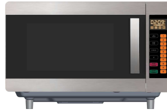
25L Commercial MWO

1200W/1000W/900W MEW95M-3/MEW95M-2/MEW95M-1 10 Auto Manul 1,400W Heavy-Duty Commercial-Grade Power Function Micro/Defrost/Digital Control/Digital Clock Material Control Panel: Stainless steel Heating: Import Magentron Cavity: Stainless Steel Technical specification Power: 1200W/1000W/900W Volumn: 25L Heating: Flatbed cavity Power Cord: 1.2m N.W/G.W: 15.5/16.5 Kgs Unit: 511(W)X382(D)X330(H)MM Carton: 590(W)X465(D)X395(H)MM Color: Stainless Steel