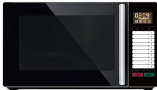
25L Commercial Inverter MWO

1400W/1100W MEW957-3V/MEW957-2V 10 Auto Manul 1,200W Heavy-Duty Commercial-Grade Power Function Micro/Defrost/Digital Control/Digital Clock Material Control Panel: Tempered Glass Heating: Import Magentron Cavity: Stainless Steel Technical specification Power: 1400W/1100W Volumn: 25L Heating: Flatbed cavity Power Cord: 1.2m N.W/G.W: 15.5/16/5 Kgs Unit: 510(W)X382(D)X303(H)MM Carton: 585(W)X460(D)X335(H)MM Color: Black