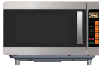
25L Commercial MWO

1400W/1100W MEW95M-3V/MEW95M-2V 10 Auto Manul 1,400W Heavy-Duty Commercial-Grade Power Function Micro/Defrost/Digital Control/Digital Clock Material Control Panel: Stainless steel Heating: Import Magentron Cavity: Stainless Steel Technical specification Power: 1400W/1100W Volumn: 25L Heating: Flatbed cavity Power Cord: 1.2m N.W/G.W: 15.5/16.5 Kgs Unit: 511(W)X382(D)X330(H)MM Carton: 590(W)X465(D)X395(H)MM Color: Stainless Steel